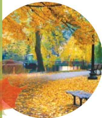
Beautiful Indiana Autumn Day

A conference pre-registration form is provided on page 6 of this newsletter and is available on the TECSCU homepage, http://tecscu.org , in the new postings area.