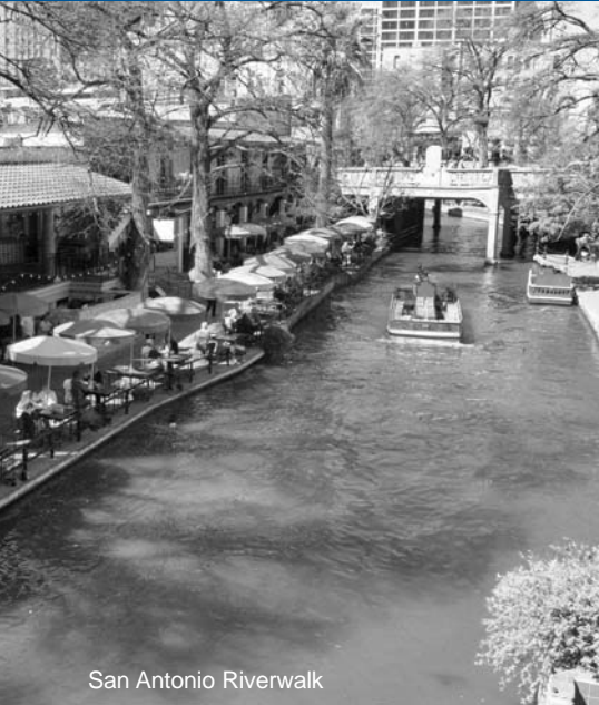
San Antonio Riverwalk